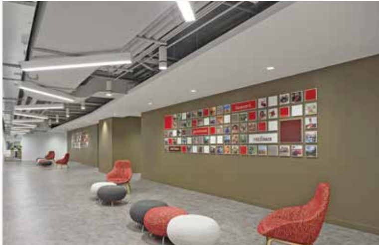
TIM HORTONS HQ | TORONTO, CANADA